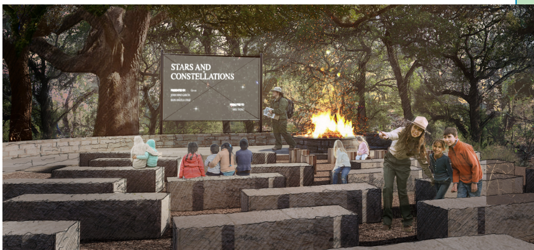
Original architectural rendering of the amphitheater project.

THE PROJECT: In 2018, Impact SA awarded a $100,000 High Impact Grant to The Friends of Government Canyon Foundation to build an educational amphitheater where visitors will learn about preservation of our clean water, indigenous animals, plants, and archaeological sites, and discover the history of this land.