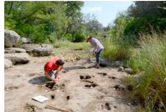
Scientists measure fossilized dinosaur tracks